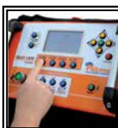
Control panel with GPS