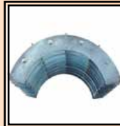
Inserts Ø 200 ÷ 500 mm