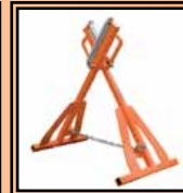
HS Rollers 630

and: Inserts Ø 6" ÷ 18" IPS; 6" ÷ 18" DIPS; KIT for IN-DITCH USE