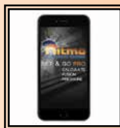
App "Set & Go Pro"