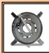
Tool for flange necks

and: Inserts Ø 2" ÷ 6" IPS; 3" ÷ 6" DIPS pre-insulated bag for heating plate