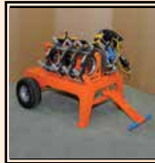
Trolley for machine body