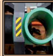
Top Clamp Short Elbows/Tee