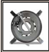
Tool for flange necks