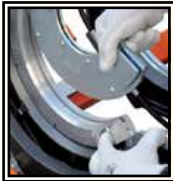
Inserts Ø 75 ÷ 225 mm