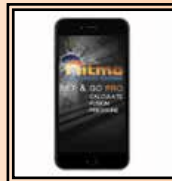
App "Set & Go Pro"