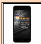
App "Set & Go Pro"