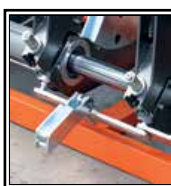
Detach device for heater