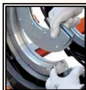
Inserts Ø 90 ÷ 280mm master Ø 250 mm