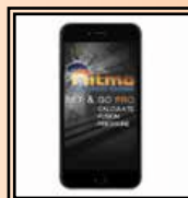
App "Set & Go Pro"