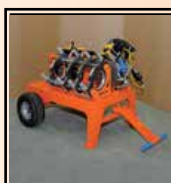
Trolley for machine body