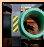
Top Clamp Short Elbows/Tee