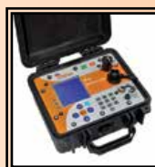
The INSPECTOR Data-logging