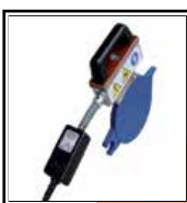
Heating plate with Digital Dragon