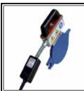
Heating plate with Digital Dragon