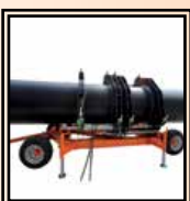
Trolley for machine body