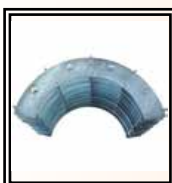
Inserts Delta 1200 Tool for flange necks Master Ø 1000 mm