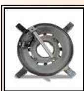
Tool for flange necks