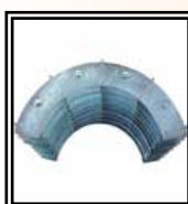
Inserts Ø 225 ÷ 630 mm