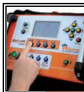
Control panel with GPS