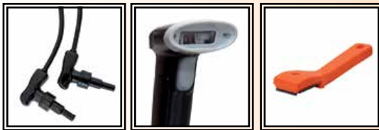
Universal connectors 90°