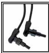
Universal connectors 90°