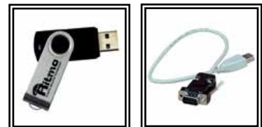
Software Ritmo Transfer