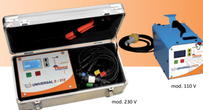
mod. 230 V