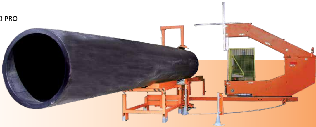
SIGMA 1200 PRO