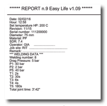
Report by EASY LIFE