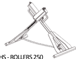
HS - ROLLERS 250

Working range max: \varnothing 250 mm (8" DIPS) Overall dimension (W x D x H): 1150 x 500 x 756 mm 45.3" x 19.7" x 29.7" Weight: 26 Kg 57.3 lb Weight capacity: 500 Kg 1.100 lb