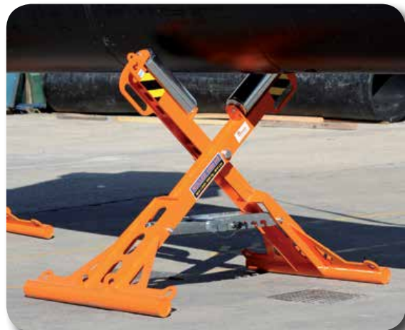
HS - ROLLERS 1000

Working range max: \varnothing 1000 mm (36" DIPS) Weight: 140 Kg 309 lb Weight capacity: 3000 Kg 6.600 lb