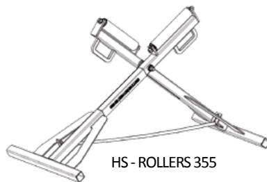
HS - ROLLERS 355

Working range max: \varnothing 355 mm (14" IPS) Overall dimension (W x D x H): 1421 x 600 x 818 mm 55.9" x 23.6" x 32.2" Weight: 33 Kg 72.8 lb Weight capacity: 1000 Kg 2.200 lb