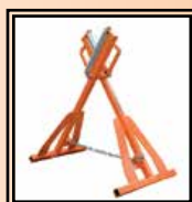
HS Roller 1000