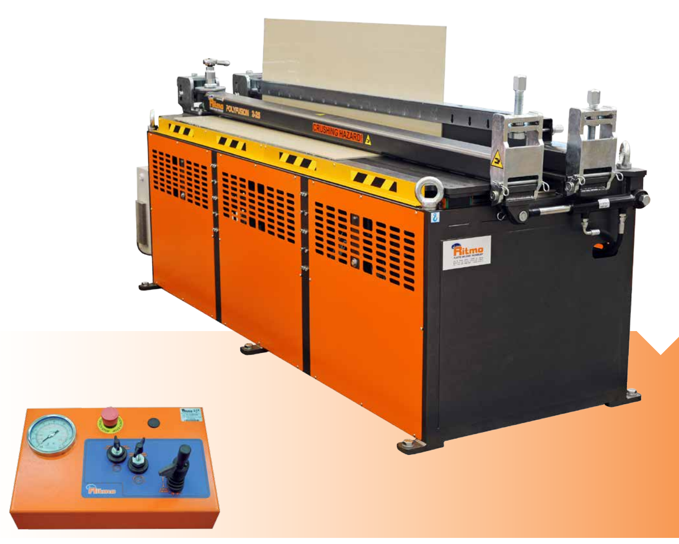
Manual Control Panel