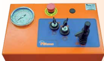
Manual Control Panel