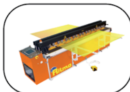
Types of welding

POLYFUSION 4-30 performs different types of weld horizontal, circular and 90° joints.