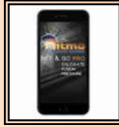
App "Set & Go Pro"

and: Inserts Ø 1" ÷ 5" IPS; 3" ÷ 4" DIPS pre-insulated bag for heating plate