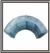
Inserts Ø 40 ÷ 140 mm