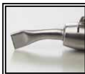
Flat nozzle 20 mm cod 67204002