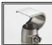
Shrink reflector cod 67205016