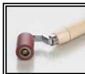
Pressure roller 1-armed 45 mm and 45° cod 67207006 bearing mounted cod 67206995