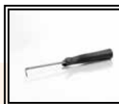
Seam tester cod 67207014