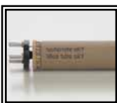
Heating element 230 V - 1500 W cod 57102007