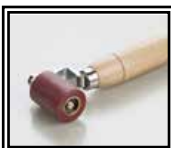
Pressure roller 1-armed 45 mm cod 67207001 bearing mounted cod 67206997