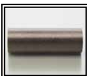
Insulating tube cod 57214011