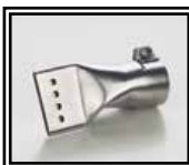
Flat perforated nozzle 40 mm cod 67204004