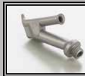
Round nozzle 3 mm with thread M10 cod 67205005