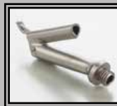
Triangular nozzle 5 mm with thread M10 cod 67205008