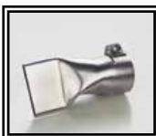
Flat nozzle 40 mm cod 67204003