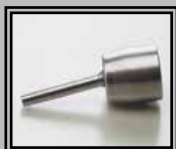
Round nozzle 5 mm cod 67204000 Standard composition with STYLO model