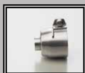
Adapter with female thread M10 cod 67204007