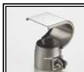
Shrink reflector cod 67205016