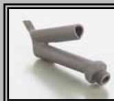
Triangular nozzle 7,5 mm with thread M10 cod 67205009