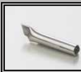
Tacking tip cod 67205015