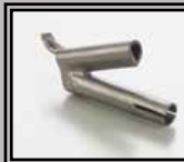
Speed welding triangular 5 mm cod 67205013