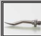
Tacking tip hooked with thread M10 cod 67205017