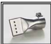
Flat perforated nozzle 40 mm cod 67204004