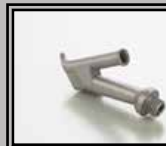
Round nozzle 5 mm with thread M10 cod 67205007