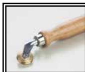
Pressure roller 5 mm for round wire cod 67207005