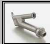
Round nozzle 4 mm with thread M10 cod 67205006