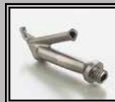
Triangular nozzle 5,7 mm with thread M10 cod 67205002