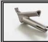
Speed welding triangular 7 mm cod 67205001