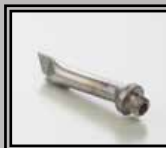
Tacking tip with thread M10 cod 67205004