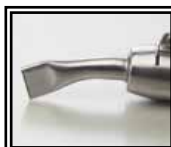
Flat nozzle 20 mm cod 67204002