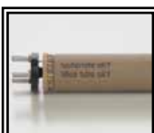
Heating element 230 V - 1500 W cod 57102007