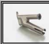
Speed welding round nozzle 5 mm cod 67205012