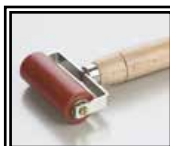
Pressure roller 80 mm cod 67207002 bearing mounted cod 67206996