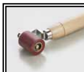
Pressure roller 1-armed 28 mm bearing mounted cod 67206994