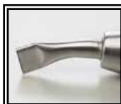
Flat nozzle 20 mm 15° cod 67204215