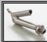
Triangular nozzle 5 mm with thread M10 cod 67205008