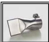
Flat nozzle 40 mm cod 67204003