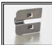
Weld seam slide cod 67205021