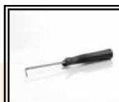
Seam tester cod 67207014