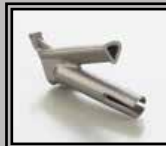
Speed welding triangular 5,7 mm cod 67205000