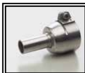
Shrink round nozzle 15 mm cod 67204005