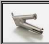
Speed welding round nozzle 3 mm cod 67205010