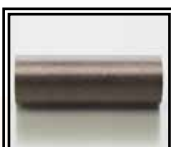
Insulating tube cod 57214011