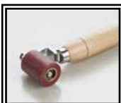
Pressure roller 1-armed 45 mm cod 67207001 bearing mounted cod 67206997