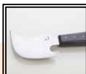
Quarter moon knife cod 67207010