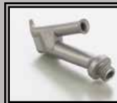
Round nozzle 3 mm with thread M10 cod 67205005