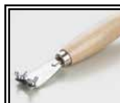
Grooving tool cod 67207011