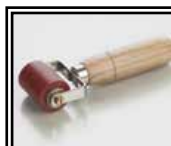
Pressure roller 2-armed 45 mm cod 67207000 bearing mounted cod 67206998